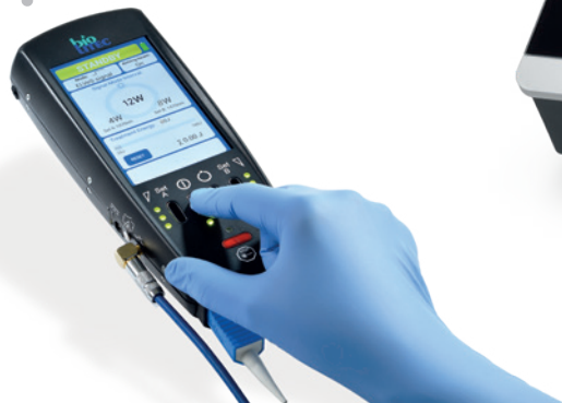
LEONARDO® Mini basic & specialist