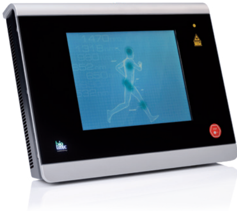
LEONARDO® DUAL 45 universal & ingenious

Our versatile and reliable LEONARDO® laser family suit your needs whatever you intend to do