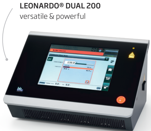
LEONARDO® DUAL 200 versatile & powerful